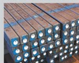
BILLETS / BLOOMS

Billets : 65mm, 77mm, 90 mm, 125mm RCS Blooms : 150 x 150, 200 x 200, 250 x 250 320 x 250mm