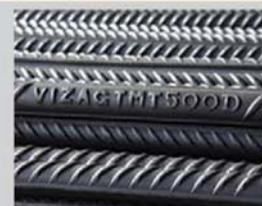
'VIZAG TMT' REBARS

Fasteners, Forging, Re-rolling, Railways, Construction etc.