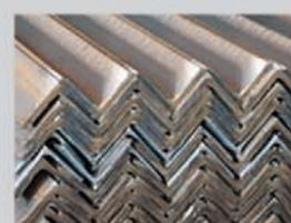
'VIZAG UKKU' STRUCTURALS

Forging, Re-rolling, General Engineering purposes etc.